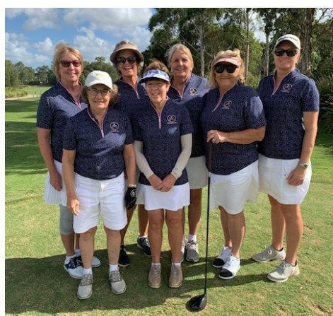
2024 Div 2 Pennant Team