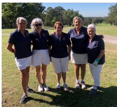
2024 Bronze South Pennant Team